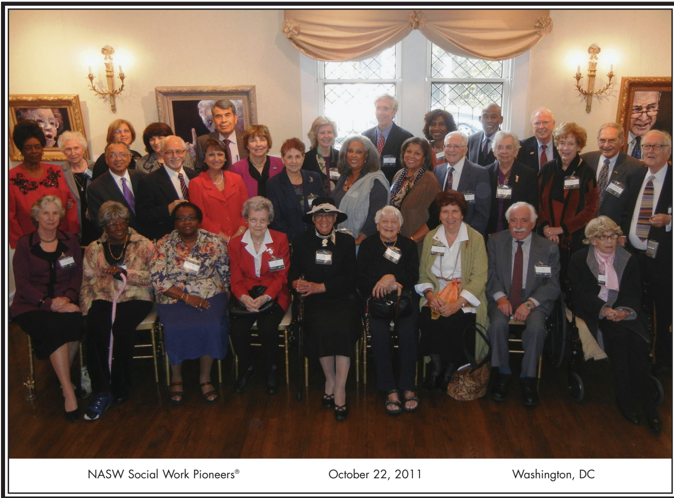
NASW Social Work Pioneers®